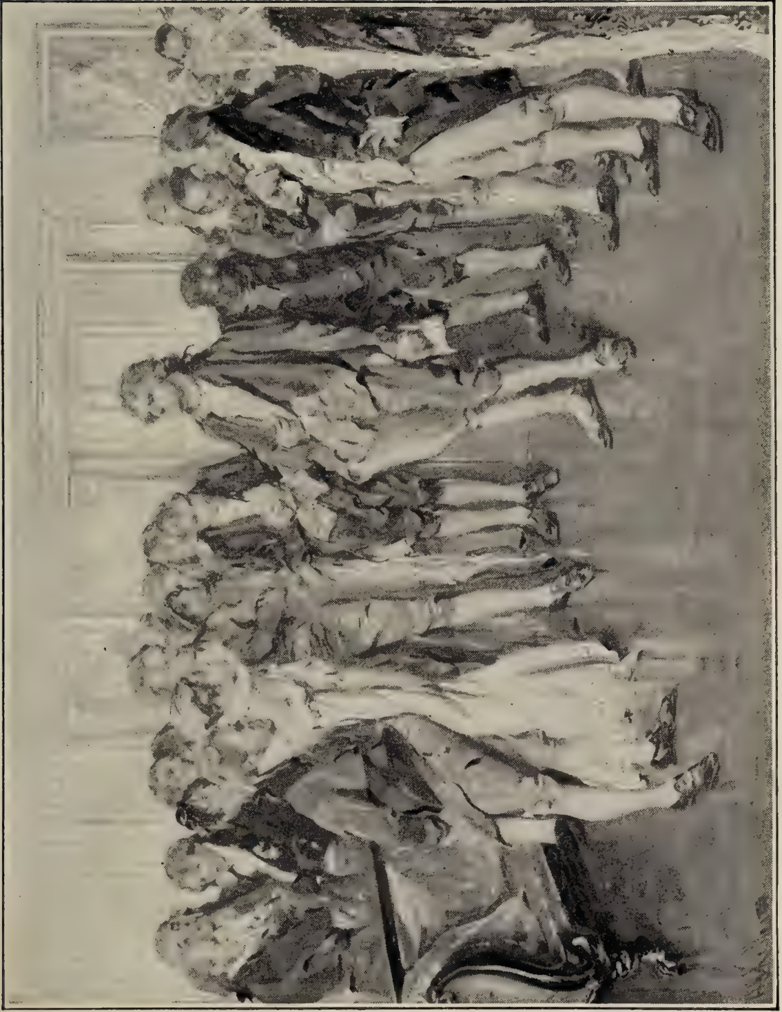
“‘Mistah Thomas Jeffahson!’ was his sole announcement”